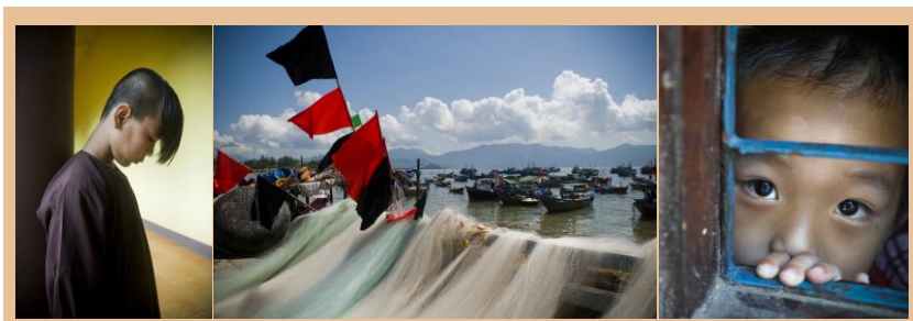
Photo Tour through Vietnam's Scenery